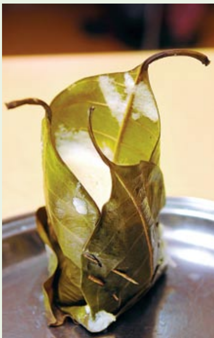
Idlis steamed in jackfruit leaves

back to 1966, this modest establishment is a ticket to the best in the Catholic culinary ledger. Pair fluffy, toddy-laced sannas with sorpotel (a fiery, sticky pork meat dish that ages deliciously) or the baffat aka dukra maas that is slow-cooked to a beautiful tenderness that is worthy of poetry. The key is a fragrant spice mix (chillies, peppercorns, cumin and more) that can be bought as a souvenir from Konkan Traders or Don Stores. If your heart doesn't say pig out, settle for Mangaluru's beloved export, chicken ghee roast, at Maharaja's and Anupam's at Abhiman Residency. Or the evergreen kori rotti. Follow the much-trodden path to Shetty's Kori Roti, ask for a takeaway (strictly advised) and head home to douse the flat, wafer-thin dried rice crepes with the accompanying spicy, coconut-based chicken gravy.