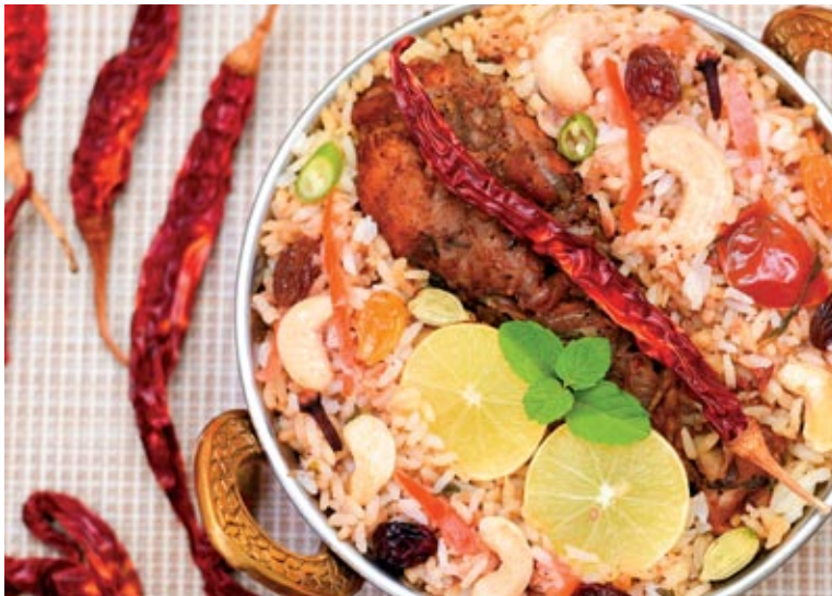
Bhatkali chicken biriyani garnished with dried red chillies

The Hyderabad-Karnataka region, bordering Andhra Pradesh and Telangana, has culinary influences like a meat heavy, spicy cuisine and the use of gongura (sorrel leaves). Locally known as pundi palya, it is popular in Central and North Karnataka and often made into chutney or cooked with lentils or mutton. The addition of local Rayadurga brinjals to mamsa (mutton) pundi palya adds a typical flavour. Hyderabad-inspired dishes like dum biryani and dalcha (meat with lentils) are common in Kalaburagi. ■