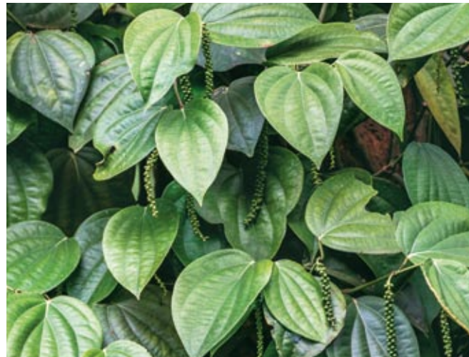
Black and gold: Turmeric (left) and black pepper are central to Malnad recipes

and being drained by the rivers Tunga and Bhadra make the region conducive to growing the bean. And, so, it grows in obedient hedgerows, watched over by a two-tier shade canopy comprising jackfruit, wild fig and rosewood trees, and then a second layer of clove, cardamom, banana and orange. True blue Coorgis can't do their mornings without steaming cups of the bellada (filter coffee with jaggery) and travellers go everywhere looking for that amazing espresso.