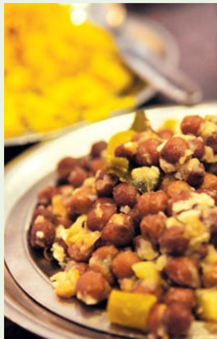
A chickpea dish at New Taj Mahal Cafe

tion. The leaves are painstakingly lined with spicy batter, steamed for over an hour and sometimes shallow-fried or tempered. Resting on its yesteryear fame, Ayodhya shares space with a sweets shop that serves a mouth-watering grape jalebi amongst other varieties. Be sure to bring your own cloth bag to carry the sugar stash.