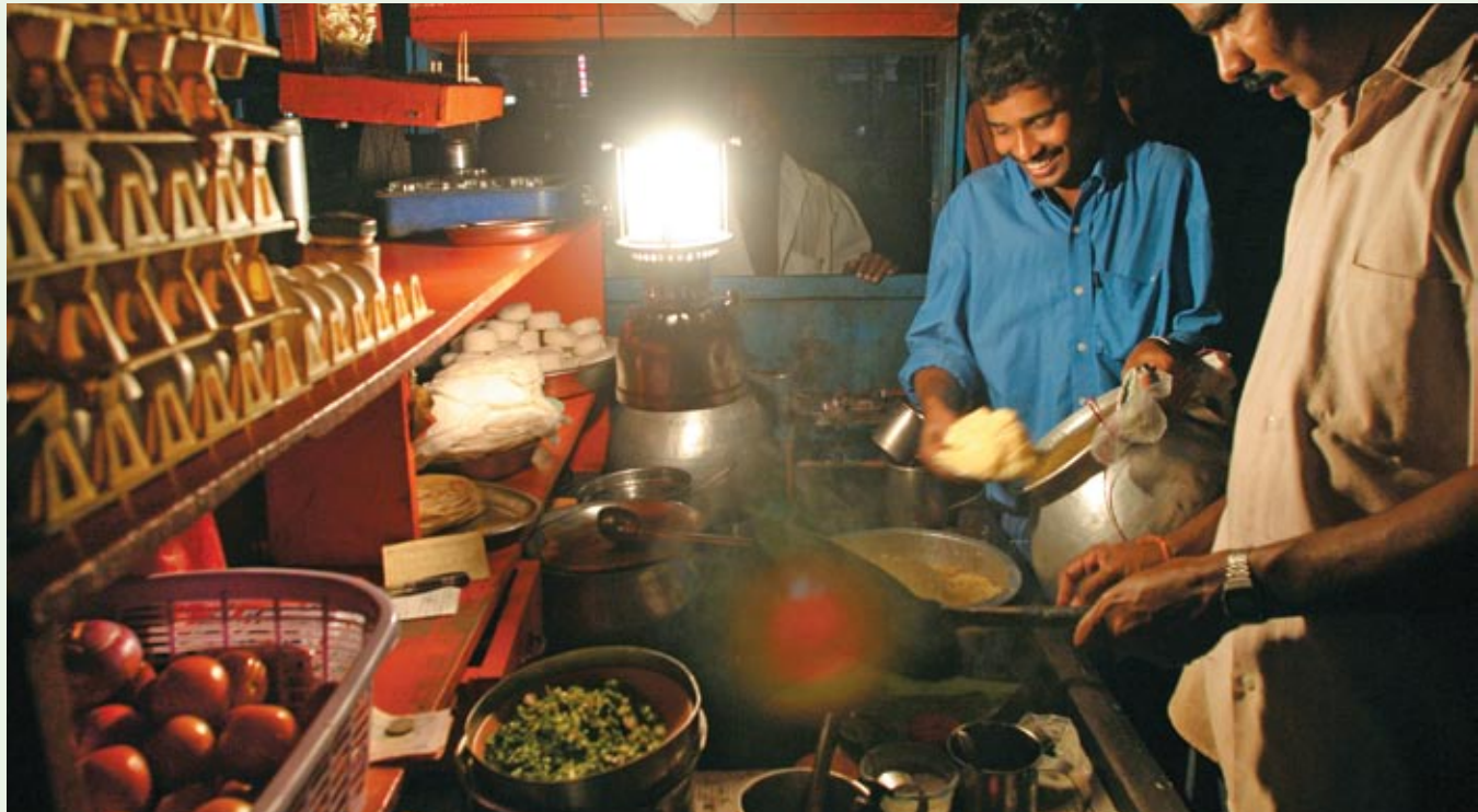
Making sannas (idli fluffed with toddy or yeast) at a restaurant in Mangalore