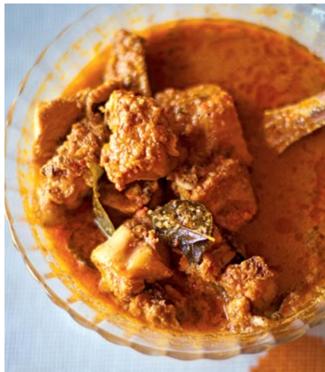
L-R: Pork naked fry; traditional chicken curry

vital factor is kachampuli, a local fruit that is inedible in the raw, but pulped and thickened creates a condiment that has a shelf life of a dozen years or more, adds that crucial pungency to the meat, helps to preserve it, fights cholesterol and zaps the nasty creatures that sometimes set up home inside pigs.