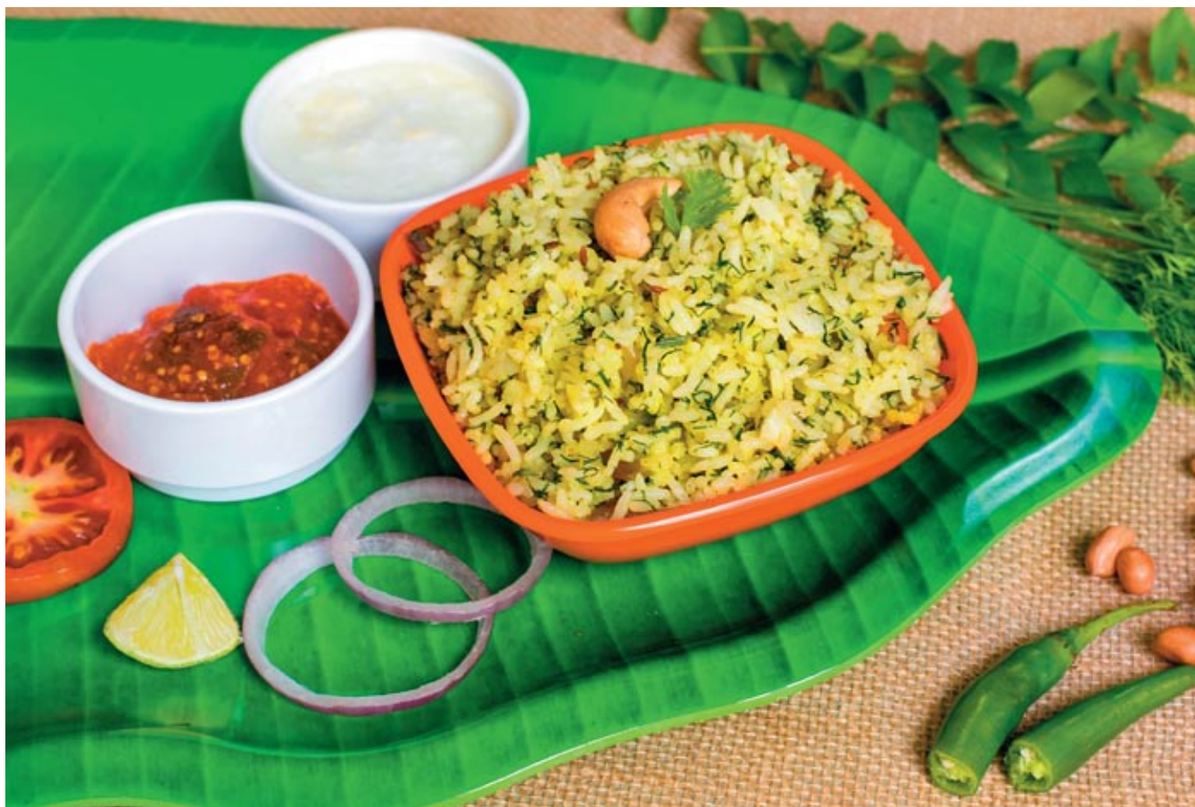
A take on the chitranna, or the lemon bath recipe Facing page: (top to bottom) pandi curry; fish fry; maddur vada

specialty restaurants and highway hotels of Bengaluru and its suburbs, you can feast not only on the Davangere benne dosa, the fluffy thatte idli, the Maddur vada and the Dharwad Peda, but also the offal-based preparations of Shivajinagar. The donne biryani, masale vade and crisp dosas with all their variations, are raging local favourites, available at iconic eateries.