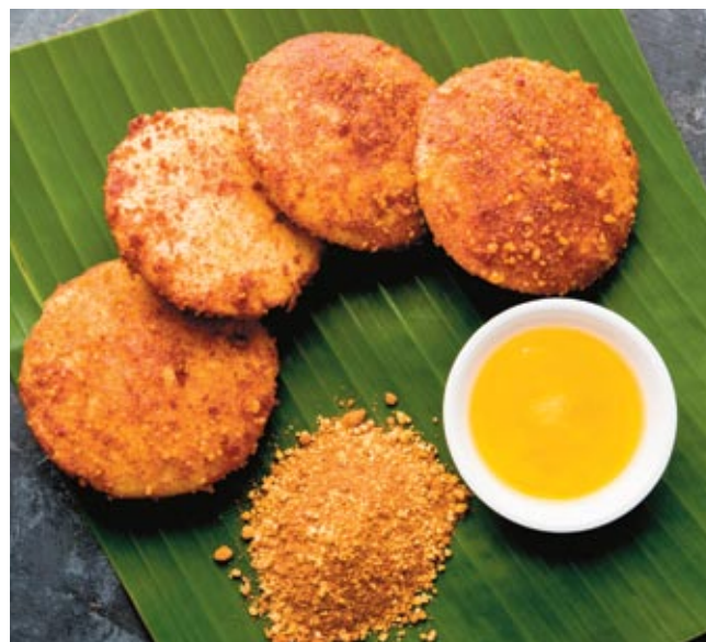
L-R: Vadas with sambar and chutney; Podi idlis, a quick-fix snack made with leftover idlis and gunpowder masala Facing page: A delectable-looking thali at a restaurant

rice-style dish neikoolu, and the neer dosa. The harvest festival of Makar Sankranti is when you can spoil yourself with some chakkara pongal and tamarind puliyogare. A dish prepared specially for Sankranti is ellu bella, a mixture of sesame, jaggery, coconut, gram, and peanuts. Ambode and mandige are wedding-specials as well as festive treats. Festivities are also a time to relish the halbai, an authentic Karnataka dessert made from jaggery, coconut and rice.