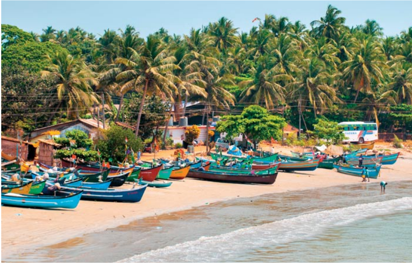
Above: The colourful Karavali coast at Murudeshwar Facing page: The otherworldly Jog Falls plunge, cutting through the mist

All these features collectively make Karnataka one of the global hotspots of biodiversity. Birdwatchers and wildlife enthusiasts flock to world-famous parks such as Dandeli, Nagarhole, Bandipur and Kabini. Fringing the Western Ghats are pristine beaches lined with forests and laterite cliffs.