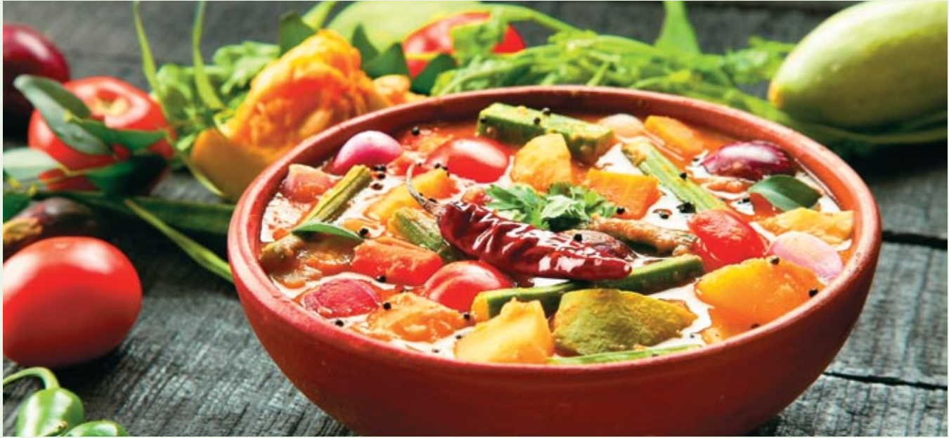
A sumptuous bowl of sambar garnished with dry red chilli