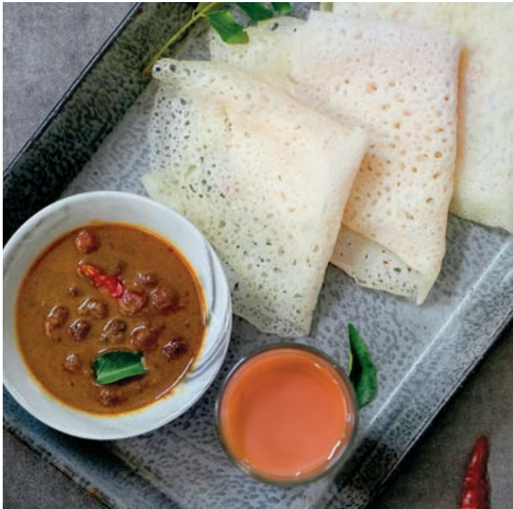
Neer Dosa is entirely different from a Masala Dosa

The tangy trinity of kokum (abundant in the Western Ghats), tamarind and raw mango is central to both vegetarian food and fish recipes. These, along with the rare jummina kaayi or teppal berries are also digestion-aiding coolants that go into curries and even drinks such as mango rasam, pepper rasam, and the solkadhi, which is famous all along the Konkan coast. The boothai sukka wouldn't quite be the excellent sardine dish it is without the addition of the juice of the bimbli fruit, which is picked and used as a souring agent all over. Mango and jackfruit are summer treats and find their way into ice cream, too.