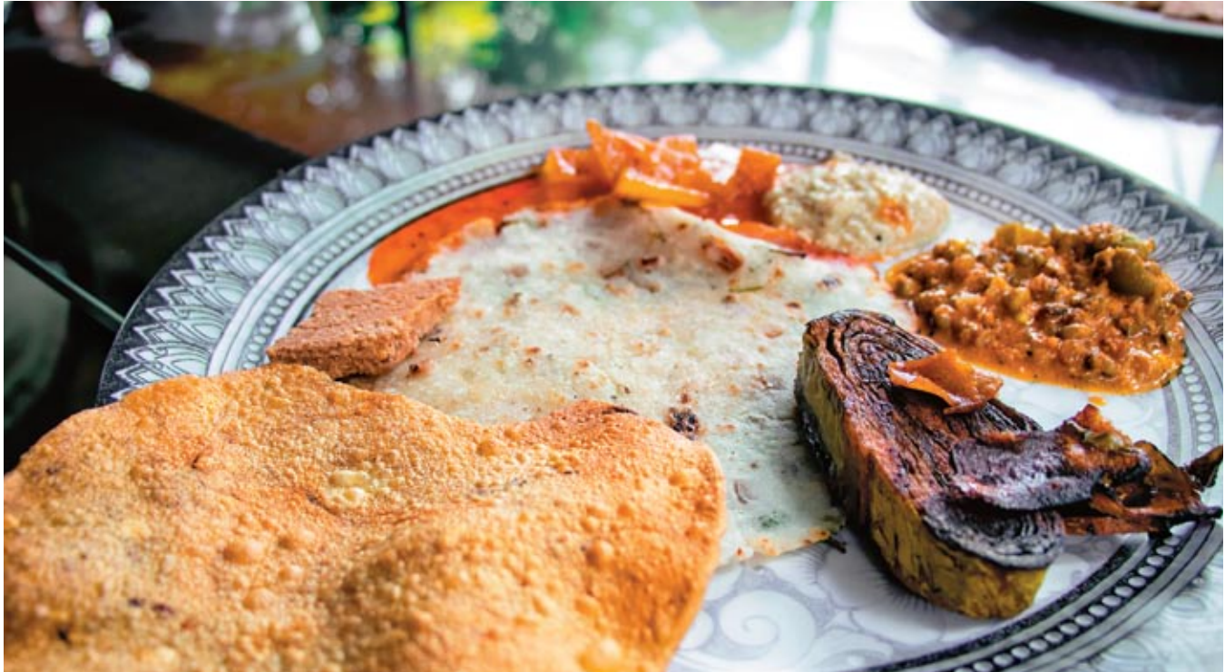
Facing Page: Coconuts are found in abundance in Malnad; Above: A Malnad lunch meal featuring pathrode