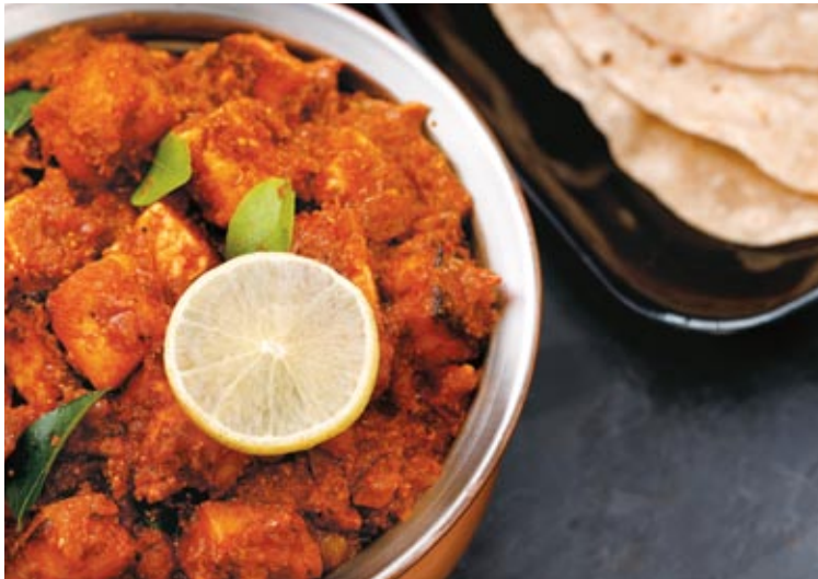
Paneer ghee roast; (bottom) a curry made with carrots and cauliflowers

all. The warriorlike Maratha affinity for chillies is often spoken of, and this love seeps in quite un-surreptitiously into the British cantonment of Belagavi. Be it sukka (spicy dry fry) or rassa (fiery curries), red chili is essential and it's easy to see why locals love their sweets too.