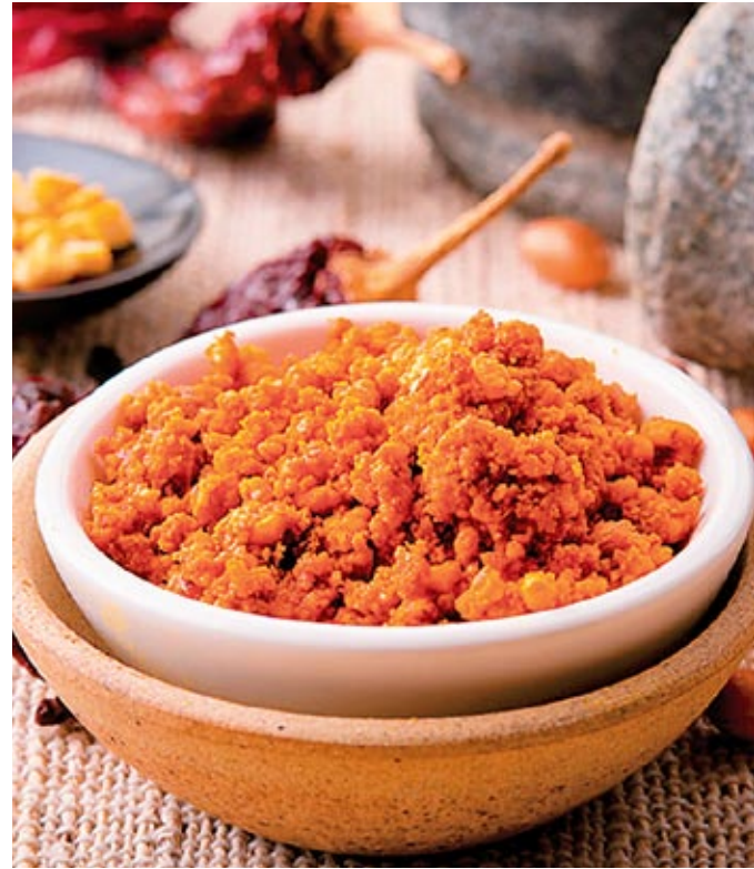
L-R: Jolada rotti and ridge gourd curry; the popular shenga chutney is made with peanuts