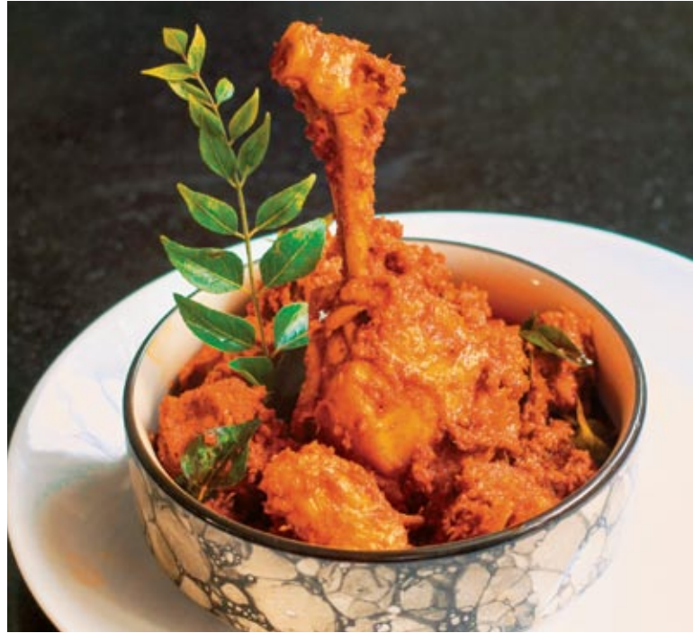
Above: Chicken ghee roast Facing Page: A huge catch at a fishing dock

Fear not, thou lovers of sweet dishes... thy quest is at an end! Ranging from Mangalore buns (made with bananas and flour) and chiroti (deep fried layered flour eaten