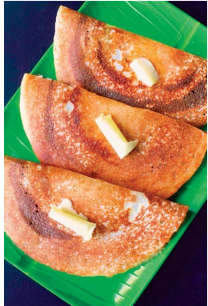
Above: (L-R) Maddur vadas, which come from the city of the same name; fragrant benne dosas

Davangere's flagship dish is the benne dosa , made with generous dollops of white butter and served with alu palya (potato mash) and coconut chutney, best savoured at Kottureshwara Benne Dosa Hotel. Hundreds of bhattis (mills) produce mandakki (puffed rice), served as mandakki oggarne (spiced puffed rice) along with mensinkayi bajji (chilli fritters). Every evening, stalls like TS Man-