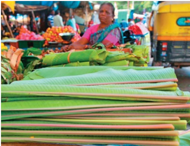
Plantain leaves for sale at a vegetable market

When it comes to Malnad's hilly swathes and the eating and drinking its inhabitants do to stay buzzing and kicking, how can one forget their relationship with coffee ever since the mystic and traveller Bababudan brought those seven beans to Chikmagalur in 1670? Karnataka produces well over half of India's coffee and three of the five varieties of India's GI-tagged coffee are from Malnad. Low temperatures