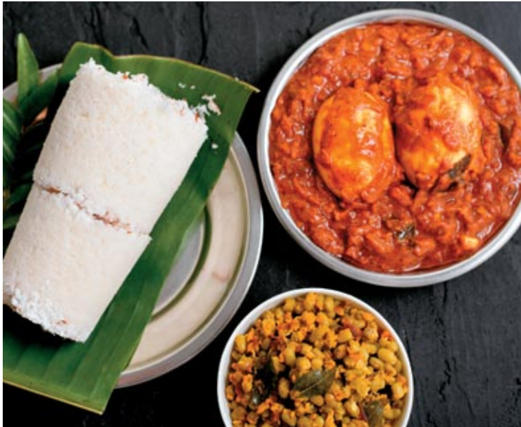
Rice puttu, spicy egg roast curry and moong dal curry

This breaking off conversation to get something to show from the garden ran through the course of my trip—a wonderfully spontaneous gesture that said a great deal about how organic the Kodavas’ relationship with eating and cooking continued to be. At Alath-Cad, where the food was arguably the best to be had anywhere in Coorg, there were fruit trees on the estate and the vegetables on Mrs Muddaiah’s table were seasonal and, again, occasionally wild. It was there that we tasted the sublime kaad mangia (wild