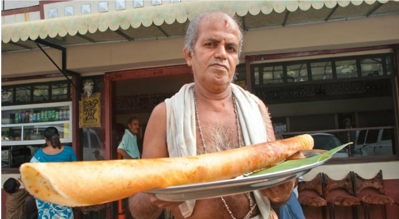
A traditional brahmin cook at Udupi's Mitra Samaj shows off a giant dosa

offered to Lord Hayagreeva at Udupi's Sri Krishna Mutt by an ardent devotee. It is believed that the deity used to appear as a white horse and demolish the sweet dish while his devotees chanted shlokas in his praise. Or modakka, which was used as a cure whenever the Lord would fall ill. Then there was the bisi bele hulianna, made from spicy red gram, rice and vegetables. The light yet filling dish made sure that the lord could play after his meals.