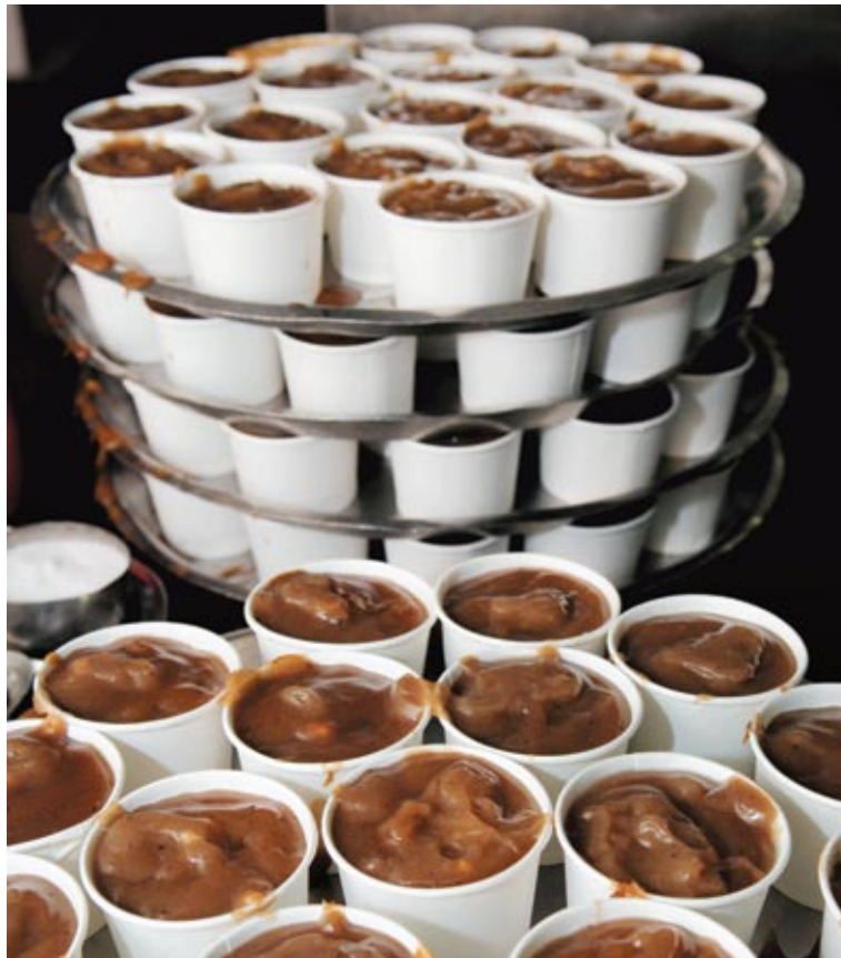
Ragi idli at Sri Ram Restaurant in Mangalore

textures. Called 'Kudla', 'Mangaluru' or the more anglicized Mangalore, this sleepy town of yore is now a bustling city, rubbing shoulders with its more renowned counterparts.