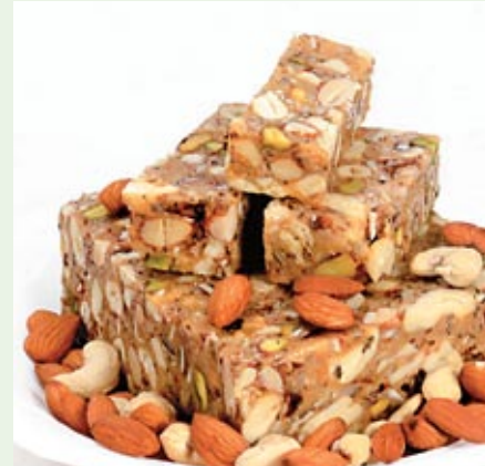
Amingad Karidaa-antu is loaded with nuts

Ballari (Bellary) is famous for its 'cycle' khova, sold on bicycles and dispensed from brass containers on