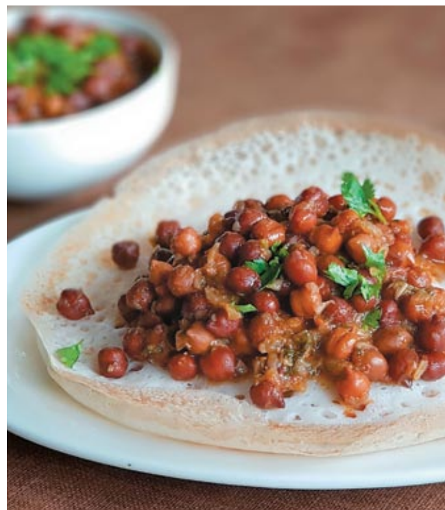
L-R: Bisibelebath; dry chickpea gravy with appam