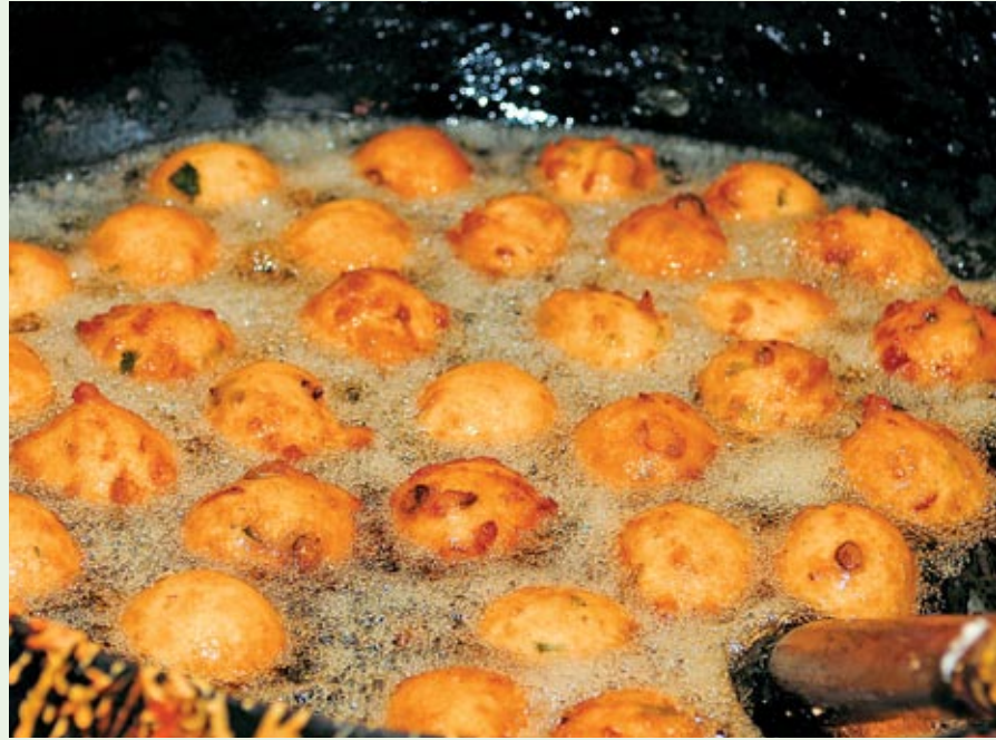
Vadas being fried at Mangalore's Sri Ram Veg Restaurant

Be it day or night, breakfast, lunch or dinner, the oft repeated food commandment in this coastal town is a trip to Pabbas at Lalbagh or Ideal at Kottara Chowki. An old chain of ice cream parlours, Ideal does justice to all your favorite dessert quotes and is synonymous with their parfait or the gadbad. The latter is a vibrant medley: a layer of kesar ice-cream topped with jelly and dry fruits followed by scoops of strawberry and vanilla ice creams. Chocolate and coffee being timeless, the tiramisu edition (no, not even a remote resemblance to the Italian), loaded with cake and nuts, will leave you tasting sugar-induced happiness.