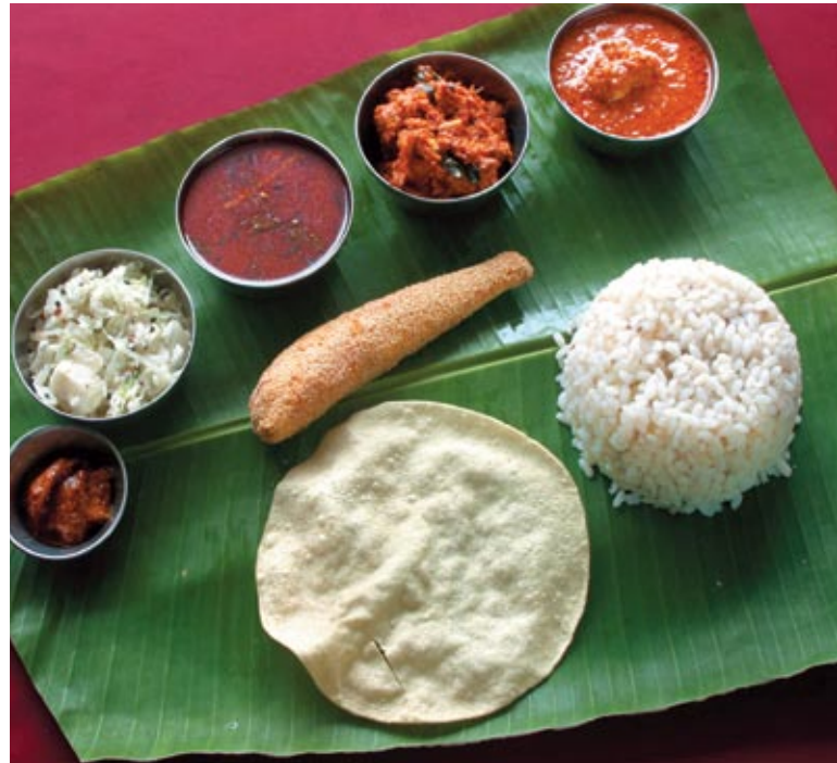
Bunt cuisine (thali) at Mangalore

A typical Udupi meal would consist of kosambari (seasoned salad made from split Bengal gram), chitranna (spiced rice), saaru (a spicy watery Idli soup), fried items like bonda, chakkuli and vada and paramanna or payasa (rice pudding), among other items. Served on green plantain leaves placed on the floor, the items are served in a particular sequence, on specific areas of the leaf. Abbhigara (ghee) is sprinkled on the rice with quaint miniature spoons. Those partaking of