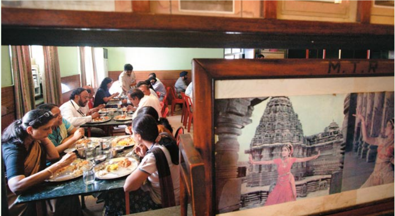
Bengalureans dine at MTR, one of the Karnataka capital's oldest and most famous restaurants