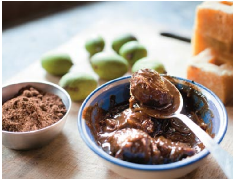
Kaad mangia curry uses mangoes and jaggery

Pandi has come to represent the specialness of Kodava cuisine—not only because it is one of those rare South Indian pork dishes but also for its unique taste. Pandi is tantalising partly because the dry spices used in it—pepper, coriander and cumin among them—are roasted before they are ground, giving the gravy a deliciously toasty flavour. The other