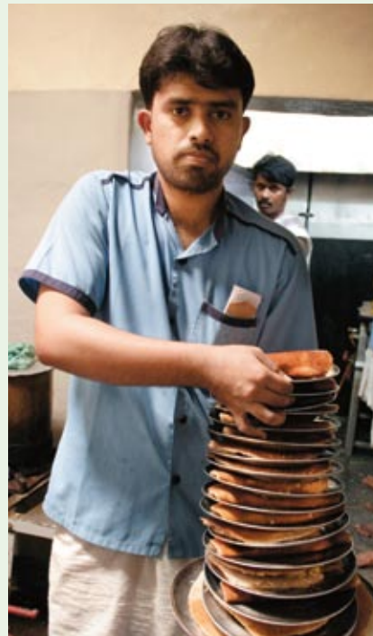
Serving dosas at Vidyarthi Bhavan

der coconut Chicken, and Spicy Chicken kababs served inside a coconut shell. Open 11.30am-11.30pm Sanadige Bengaluru (Tel: 41291300) at 32, Goldfinch Hotel, Race Course Road, 3 Crescent Road, High Grounds, serves a host of traditional culinary delights. They are good for their sea food. Open noon-3.30; 7pm-11pm. In Whitefield Oota Bangalore atop the Windmills Craftworks at No. 331, 5B Road, EPIP Zone, promises you authentic specials from around Karnataka. Some more Bengaluru 'institutions' include the Koshy's Bar and Restaurant (Tel: 22213793) on St Mark's Road, one of the oldest restaurants in the city, and the hub of artists, journalists and activists.