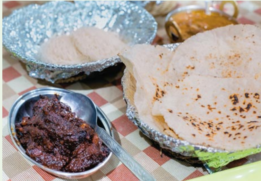
A typical Coorgi meal served at a restaurant in Madikeri