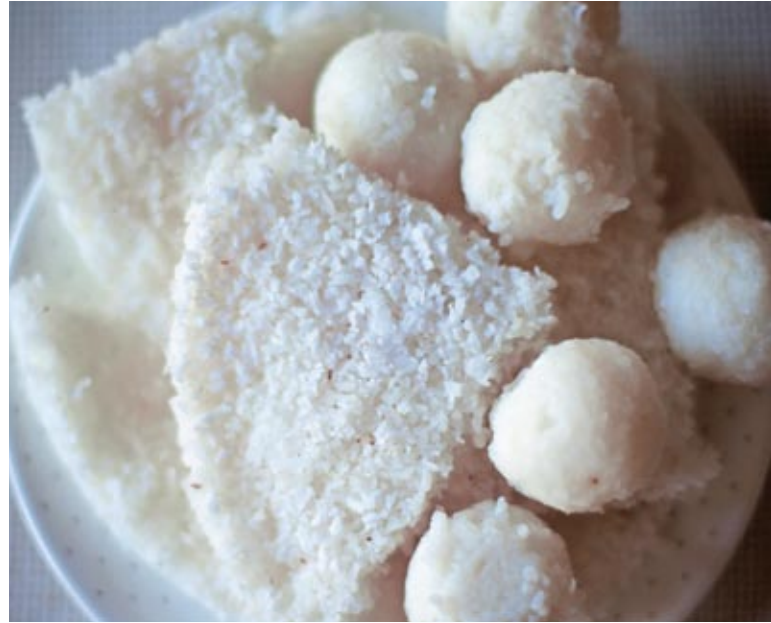
Papittu (rice cakes) and kadampittu (rice balls)

Kachampuli is another ingredient which finds itself in almost every household in Kodagu. You can say that it's their answer to the Balsamic vinegar, which is extracted from the ripe fruits of the Kodambuli fruit. The cook puts the fruits in baskets over large vessels. This lets the juice of the fruit which